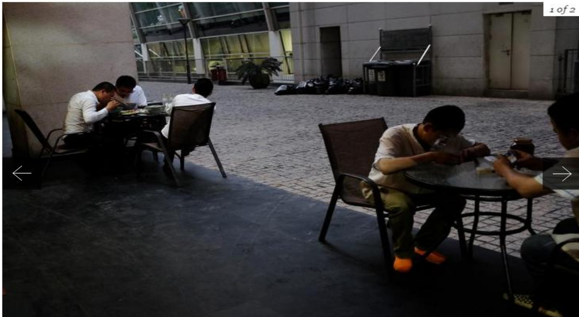
China has launched a new app to allow the public to upload pictures or other evidence of corruption. In this photo, two chefs (R) look at their smartphones as customers eat outside a restaurant in Beijing on June 16, 2015.