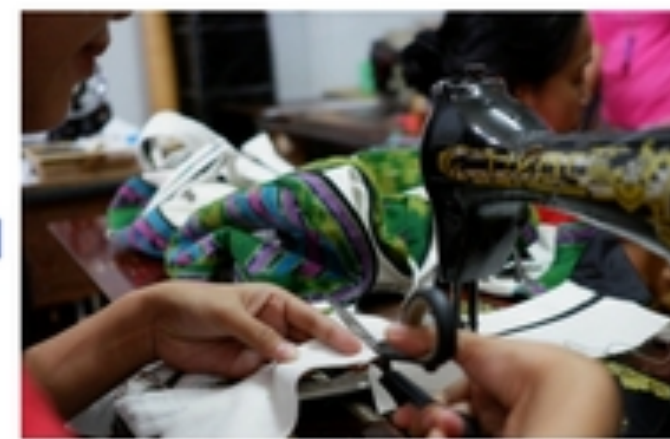
manufacturing the products