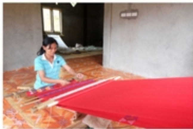
purchases woven fabric from local weavers as the partners

To be an inclusive place for everyone to creatively collaborate without boundaries