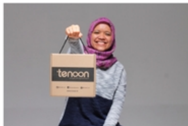
sell the products (online and offline)