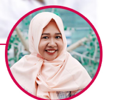
Winarni K.S (@winslicious)