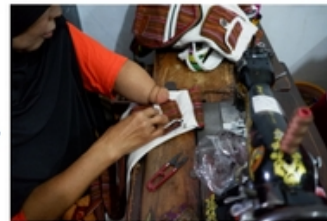
giving training to disabled and marginal community