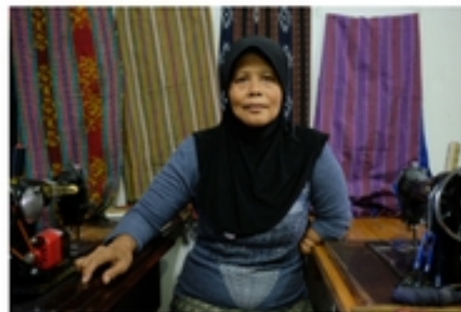
engage with disabled people and marginal community