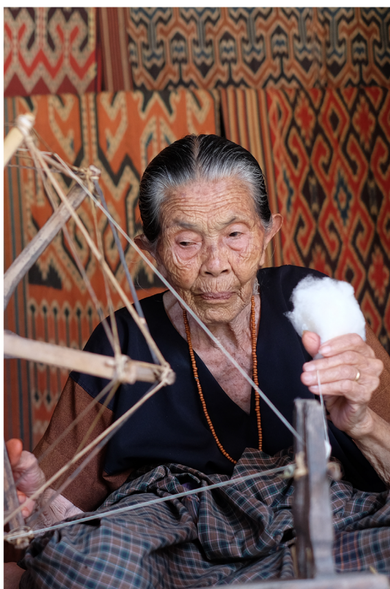
PRESERVING THE CULTURE