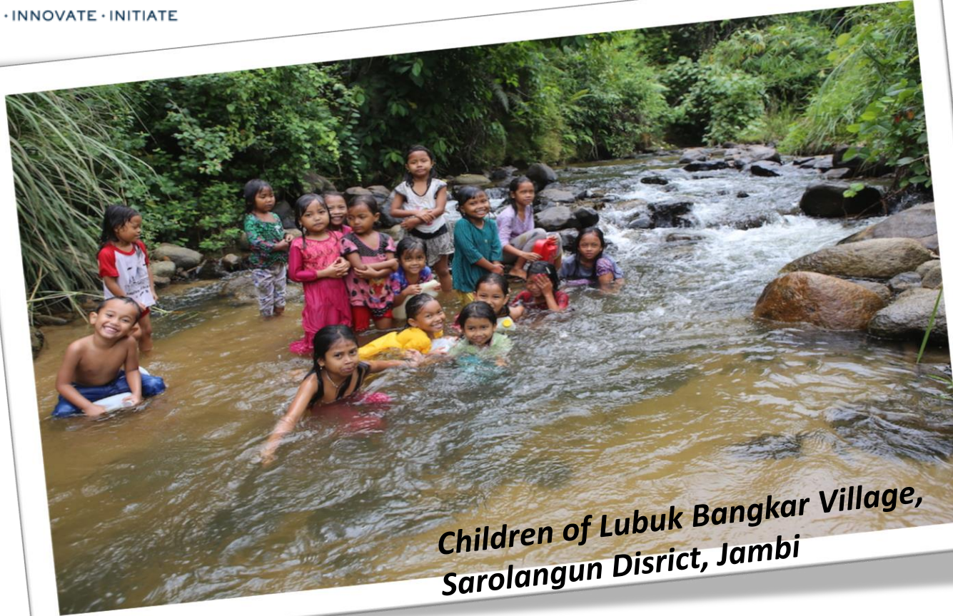
Children of Lubuk Bangkar Village, Sarolangun District, Jambi