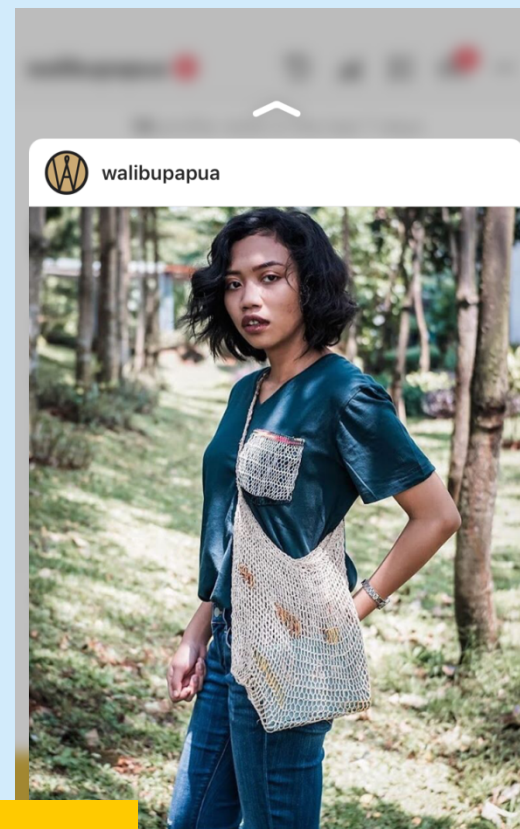
Selling through online platform