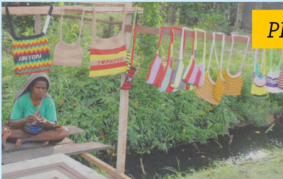
Less appropriate selling places